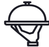
Onsite Dining and Other Entertainment Options