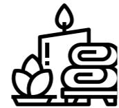
Hospitality Resort & Cottages