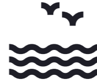
Expansive Lake and Golf Course Views

Lakowe Lakes Golf & Country Estate, often described as 'West Africa's best kept secret', is a beautiful, luxury community nestled in a peaceful neighbourhood about 35km from the hustle and bustle of Lagos. Enjoy the natural beauty and serenity of our 308-hectare community of luxury houses, beautiful lakes, lush palm groves, spa and hospitality resort, sports facilities, and an 18-hole championship golf course. An imposing 55 hectare man-made lake is the centrepiece of the entire development.