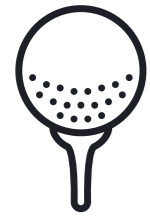
18-hole championship golf course