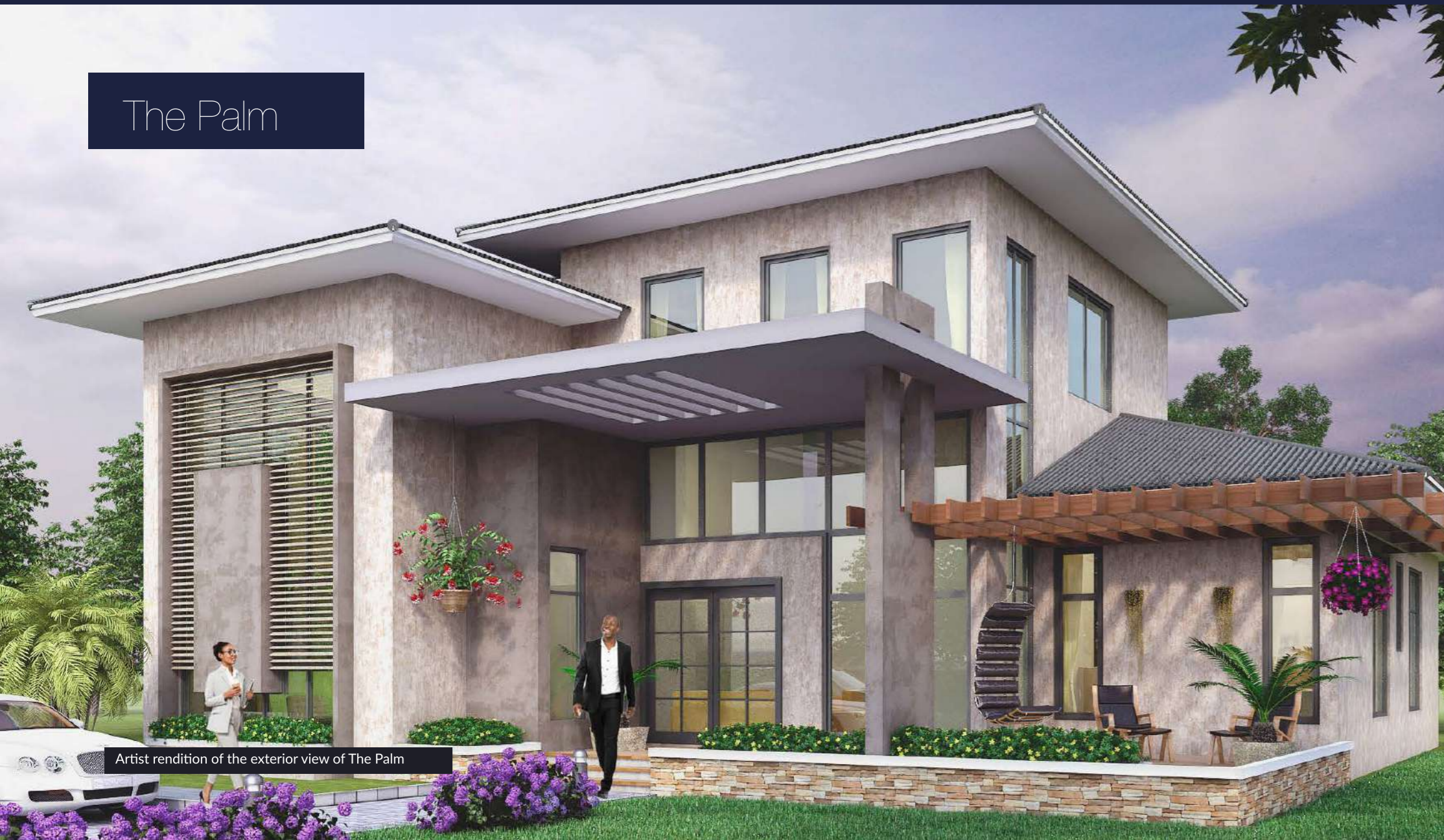
Artist rendition of the exterior view of The Palm

The Palm is a chalet-style villa, with the privacy of a separate top floor.