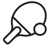
Access to Recreational Facilities